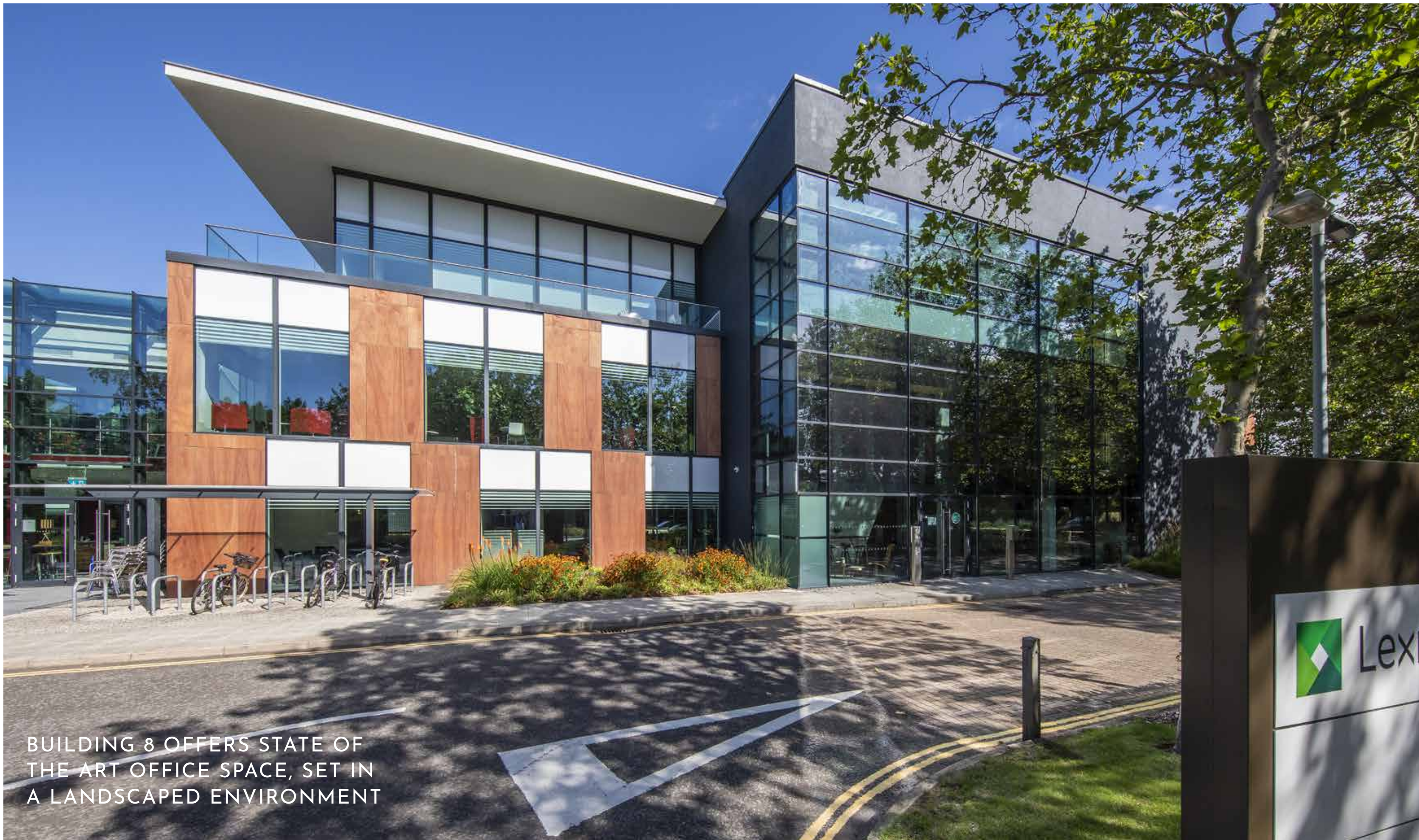
BUILDING 8 OFFERS STATE OF THE ART OFFICE SPACE, SET IN A LANDSCAPED ENVIRONMENT