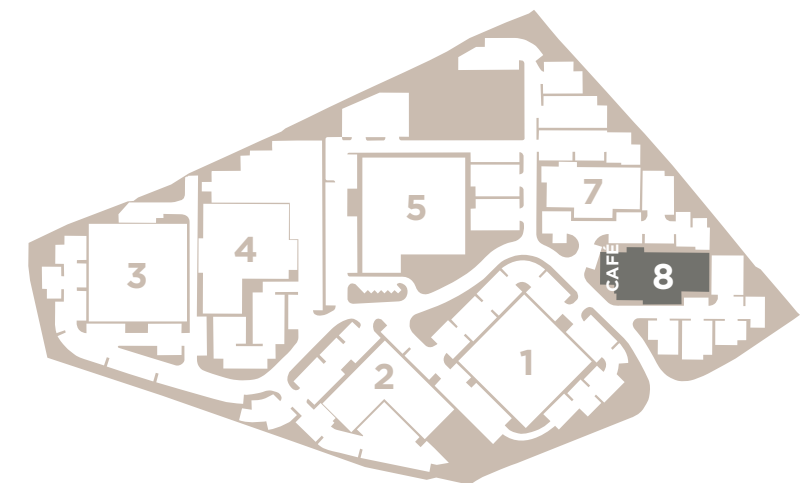
Buildings 8 - Available to Let