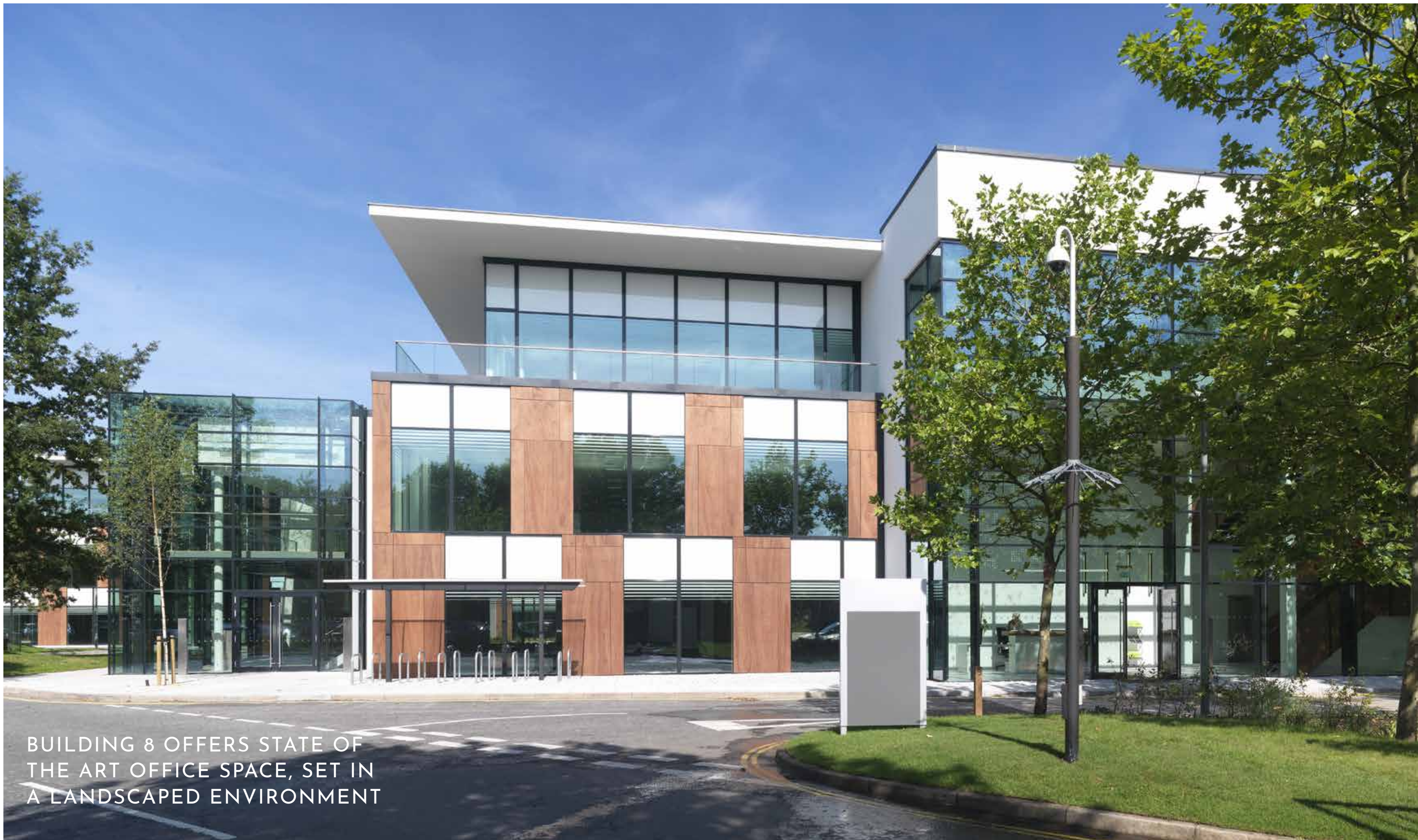
BUILDING 8 OFFERS STATE OF THE ART OFFICE SPACE, SET IN A LANDSCAPED ENVIRONMENT