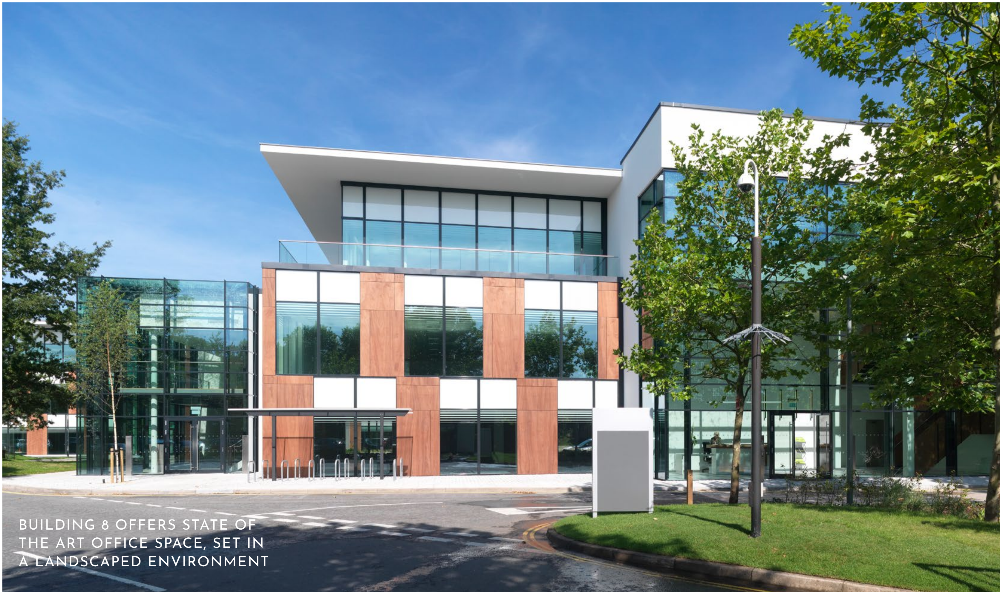
BUILDING 8 OFFERS STATE OF THE ART OFFICE SPACE, SET IN A LANDSCAPED ENVIRONMENT